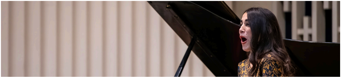
Cleveland Chamber Music Society