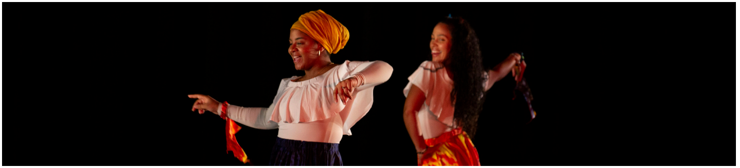
The Movement Project, Artist Caribe Conexión