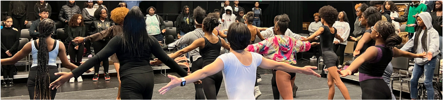
Cleveland School of the Arts Board of Trustees