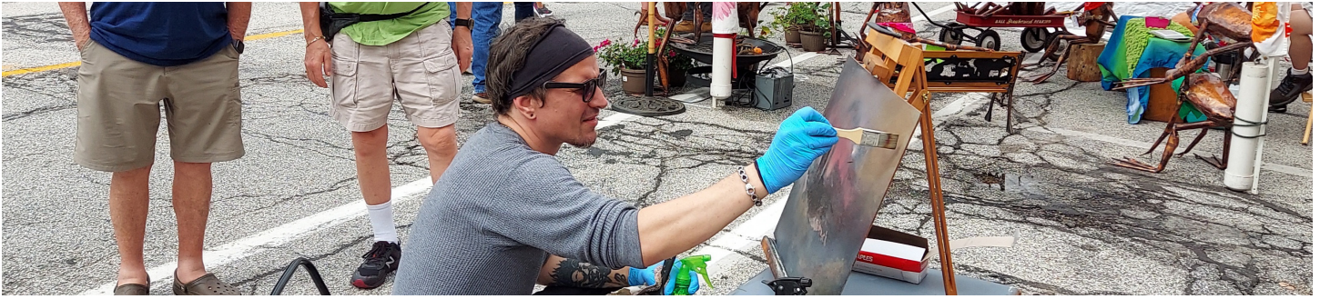
Berea Arts Fest