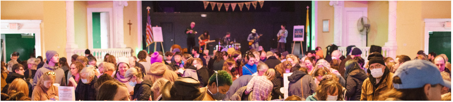
Cleveland Seed Bank, Photo by Grace McConnell