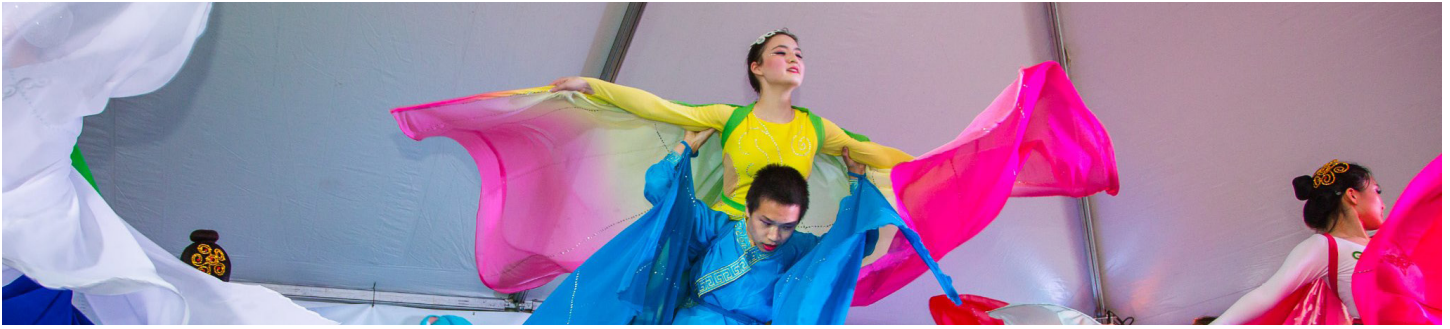
OCA Greater Cleveland, Photo by Ed Wong