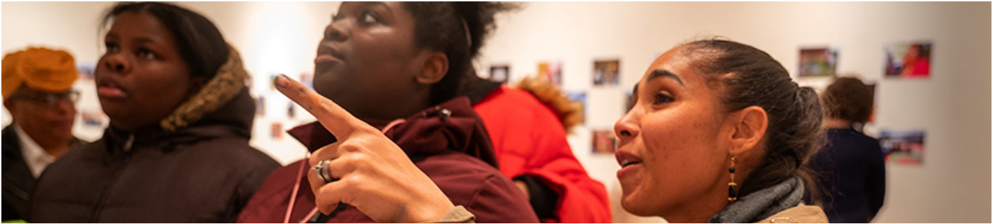
Cleveland Photo Fest