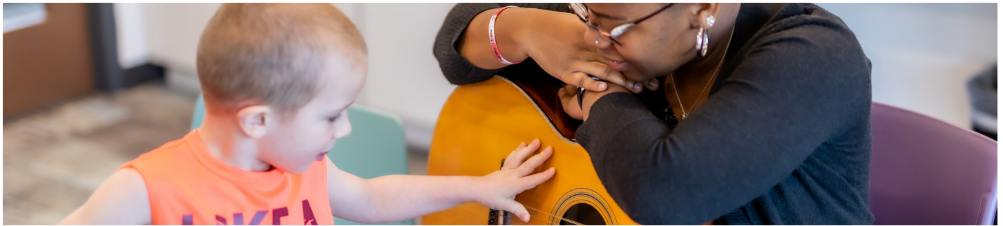
Connecting for Kids