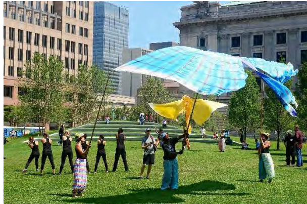
County residents enjoy outdoor activities in Public Square.