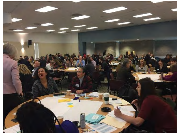
Attendees at CAC's Cuyahoga Voices & Vision Briefing and Conversation on March 22.

The gathering also served as an opportunity to gather input from attendees, start conversations, and provide space for networking. Based on a post-event survey, 88% of attendees left the event with a better or somewhat better understanding of CAC's planning process, outcomes, and vision for the future. Also, 85% felt that the event answered or somewhat answered any questions they had about the Cuyahoga Voices & Vision project.