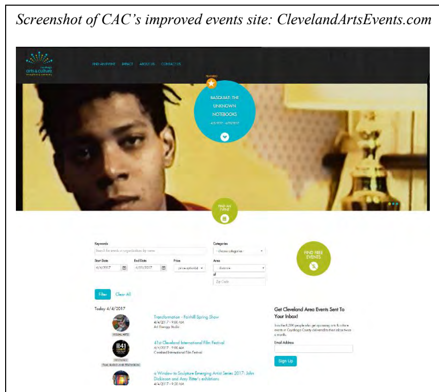
Screenshot of CAC’s improved events site: ClevelandArtsEvents.com