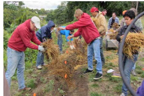
Enhancing Education: Students collaborate in a hands-on project at a recent permaculture design course.

Green Triangle works to create social, ecological and economic sustainability in Northeast Ohio using permaculture design techniques (often referred to as ecological design or engineering). With support from CAC (Project Support II), Green Triangle is offering more learning experiences for residents. They are presenting a seven-week permaculture design certification course about practical design approaches for creating community ecosystems that have the means to support themselves indefinitely.