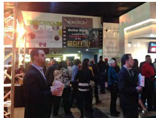
A CAC Banner hangs in the lobby of Tower City Cinemas.

The 39 th Cleveland International Film Festival (CIFF) took place on March 18-29 at Tower City Center and in neighborhoods across Cuyahoga County. More than 400 screenings brought together film buffs, students and residents (attendance was 100,204) for inspiring, community-centered events. Since 2008, CAC has invested more than $1.1 million in the Festival to help CIFF offer educational programs like "FilmSlam," where thousands of local high school students experience new films and interact with some of the world's most innovative filmmakers.