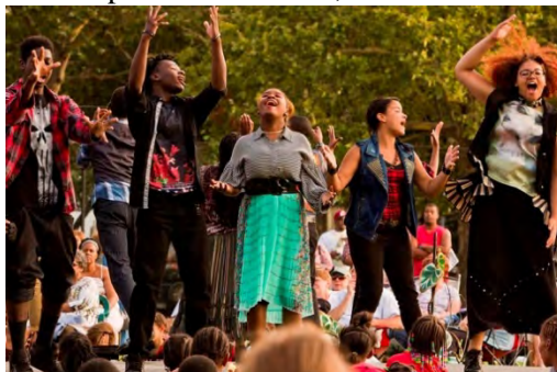
Students perform their original play in public parks throughout the City of Cleveland.

For the past 20 summers, Cleveland Public Theatre has engaged more than 800 local teens in STEP, an arts-based job training program. During the program, student participants engage in a powerful, eight-week intensive that focuses on excellence in performance, play creation, writing and production. Students earn money while learning and practicing valuable job skills. Under the guidance of artistic mentors, teens develop an original play and perform it in public parks throughout Cleveland.