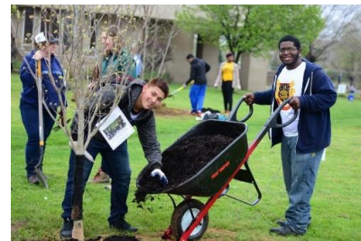
Pictured from left to right: Stellar Acrobatic Dance Company, India Festival USA, Western Reserve Land Conservancy (All three will receive CAC funding for the first time in 2019)