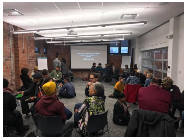
In December 2018, twelve artists and twelve nonprofits gather for the first of three full-day workshops in CPCP’s Learning Lab, funded by CAC.