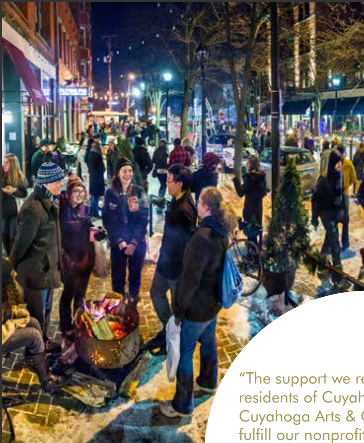
BRITE WINTER FESTIVAL