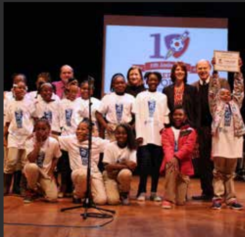
AMERICA SCORES CLEVELAND

CAC-funded organizations served 1.4 million children in 2013 and offered: