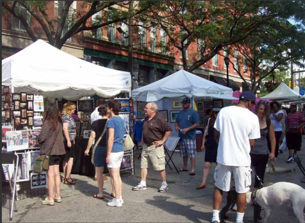
WAREHOUSE DISTRICT STREET FESTIVAL

Cuyahoga Arts & Culture funding helps build stronger, more resilient arts and culture organizations that, in turn, make an impact on the local economy. Visitors from the county, region, around the country, and around the world, enjoy our world-class arts and culture. And, companies based in Northeast Ohio cite Cuyahoga County's vibrant arts and culture offerings as key to attracting and retaining talented employees.