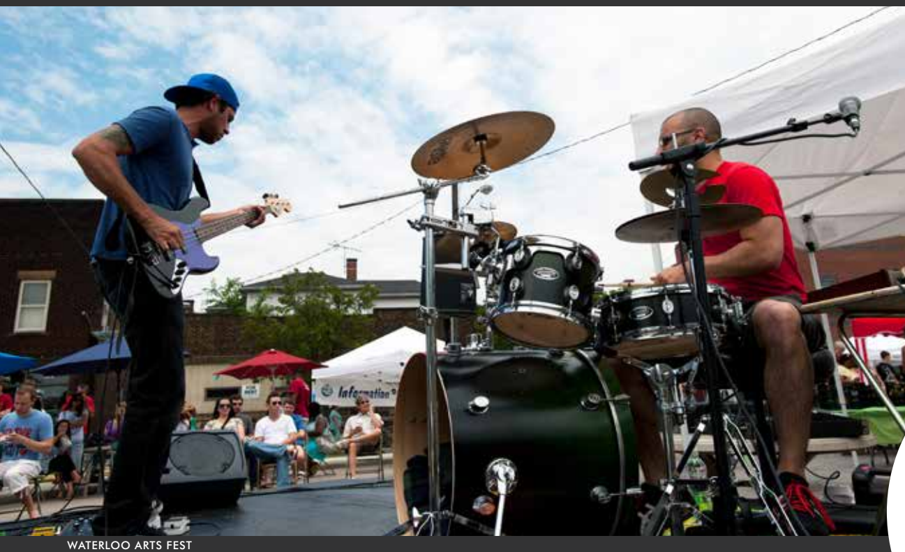
WATERLOO ARTS FEST

Each year, Cuyahoga Arts & Culture funds tens of thousands of events and programs that take place in communities throughout Cuyahoga County, which provide a wide array of activities for everyone to experience. These offerings enrich our quality of life, bringing people together to celebrate the things that make Cuyahoga County a unique place to live.