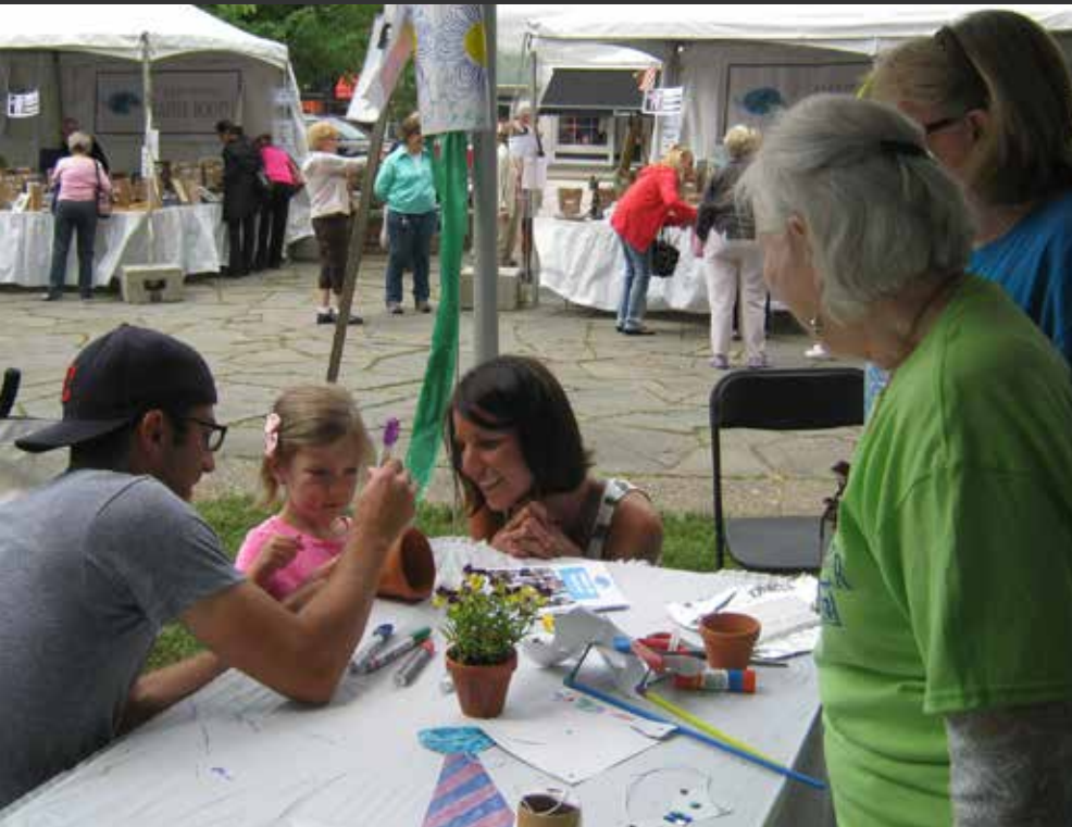
VALLEY ART CENTER'S ART BY THE FALLS