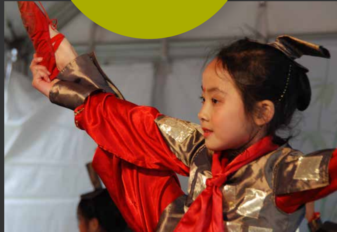
CLEVELAND ASIAN FESTIVAL

Valley Art Center's Art by the Falls is a two-day, juried fine arts and contemporary crafts festival, now in its 32nd year, held in Chagrin Falls each June. 15,000 visitors from around the region return yearly to view and purchase the work of 120 artists from around the country including painting, drawing, photography, sculpture, textiles, jewelry, weaving and ceramics.