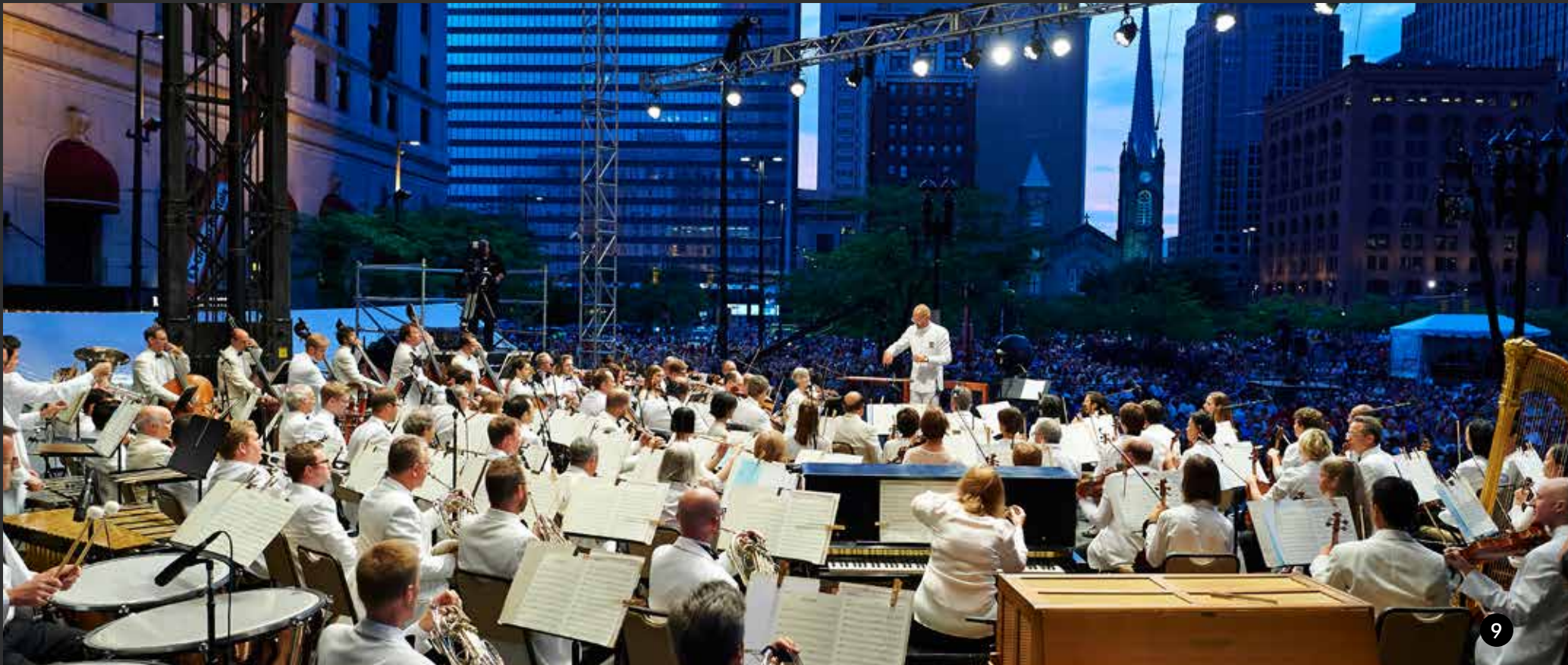
THE CLEVELAND ORCHESTRA'S STAR-SPANGLED SPECTACULAR

Each year since 2007, support from Cuyahoga Arts & Culture has helped to present The Cleveland Orchestra's Star-Spangled Spectacular . This Cleveland tradition provides an opportunity for thousands of residents to experience a free outdoor Cleveland Orchestra performance.