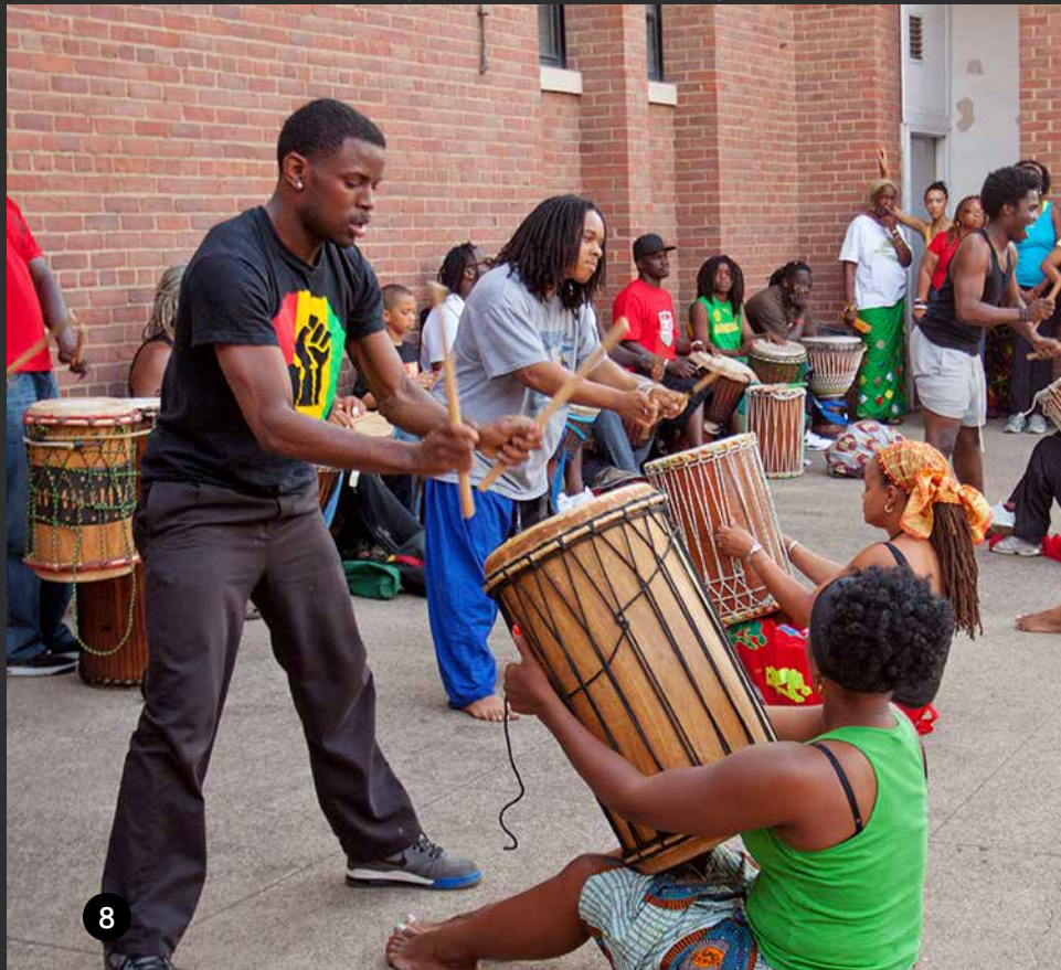
DJAPO CULTURAL ARTS INSTITUTE (NEIGHBORHOOD CONNECTIONS)