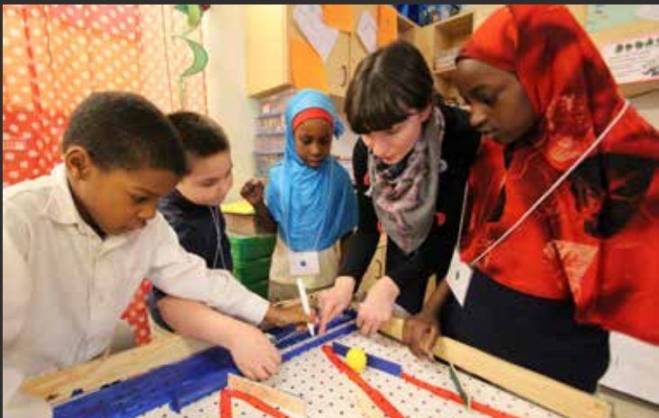
PROGRESSIVE ARTS ALLIANCE