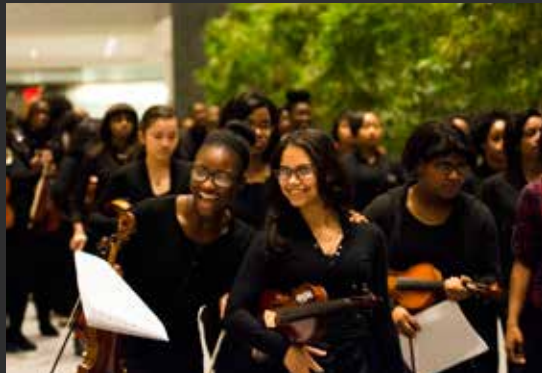
FRIENDS OF CLEVELAND SCHOOL OF THE ARTS