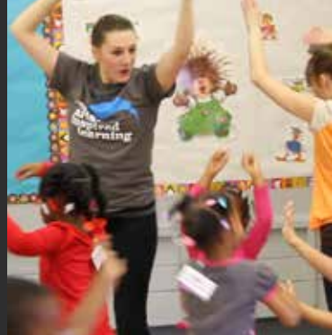
CENTER FOR ARTS-INSPIRED LEARNING

And 418,833 residents attended classes and workshops.