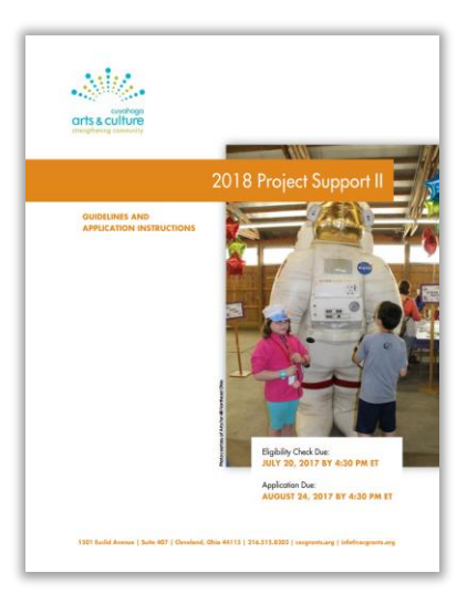
CAC's 2018 Grant Guidelines, pictured above, opened to applicants in mid-May.