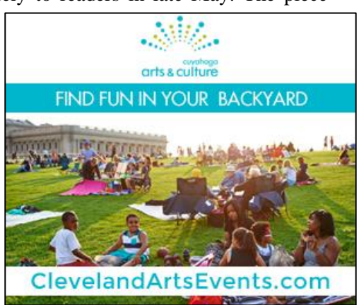
A sample of CAC's ads -which will reach thousands of residents through our pilot digital marketing campaign this summer.

In addition, CAC will test a new communications strategy by leveraging digital marketing through a partnership with Raycom Media, managed by CBS/Channel 19 Cleveland. Through a modest investment, staff will develop ads that will be delivered to mobile and desktop web users who fit a marketing profile and express an interest in arts and entertainment. CAC ads will be shown more than 120,000 times per