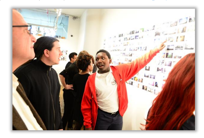
Project Support in Action: Cleveland Print Room's opening event.