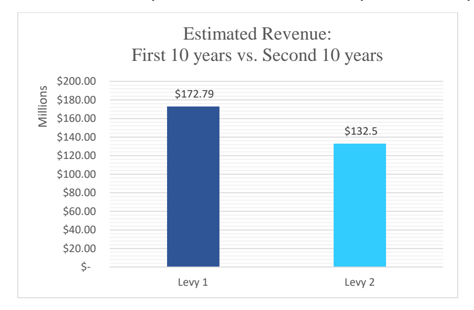
Chart 1 – Predicting Available Revenue: Comparing CAC's first 10 years of revenue (February 1, 2007 – January 31, 2017) to our second ten years of estimated revenue (February 1, 2017 – January 31, 2027).

We anticipate that excise tax revenue will continue to decline over the current (2<sup>nd</sup>) levy at a rate of 2.6% per year. This is a best estimate based on the declines seen in the previous ten years. Looking forward, we anticipate the second 10-year levy cycle will generate $40 million less than the first 10-year levy. ($132.5 million).