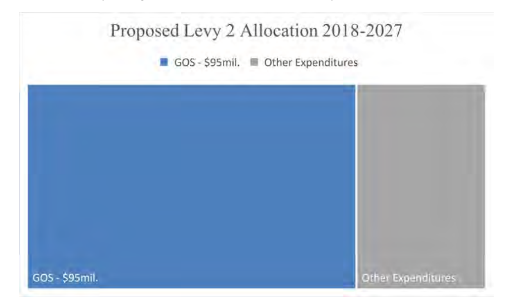
(Other expenses include: Project Support, Support for Artists, Neighborhood Connections, Downtown 4<sup>th</sup> of July concert / Cleveland Orchestra, funds for Equity & Experimentation, Operations)

Chart 2: Proposed Expenditures for 2018-2027. This chart reflects how we recommend funds be allocated over the next 10 years, grounded in our Allocation Policy.