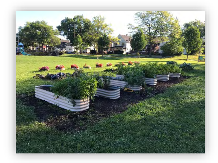
Kulture Kids has received Project Support I funding since 2015

These are general guidelines and are subject to change based on the total CAC funds available to the Project Support grant program in any given year. It is possible that all of the allocated Project Support grant funds could be awarded to those applicants receiving higher scores and applicants with lower scores (within the 75-100 point range) will not receive funding.