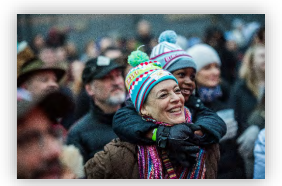
Brite Cleveland has been a Project Support recipient since 2015.

The purpose of Cuyahoga Arts & Culture's Project Support (PS) grant program is to promote public access and encourage the breadth of arts and cultural programming in our community by supporting Cuyahoga County-based projects. Grant applications are reviewed annually through a transparent panel review process. CAC will offer two Project Support grant options in 2019 for projects occurring in the January 1 – December 31, 2020 grant period. This document provides the guidelines and application instructions for the Project Support I program.