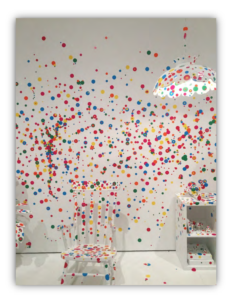
Cleveland Museum of Art.

The Statement of Assurances is the last step in the application process. An authorizing official will certify that s/he is authorized to submit the application on behalf of the organization and that the information submitted in the application is true and correct to the best of his/her knowledge.