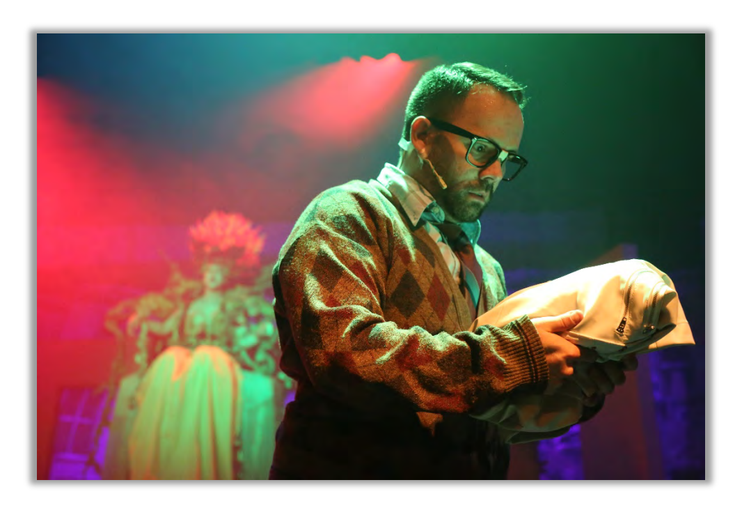
Cassidy Theatre has received Project Support I funding since 2013.

Please note: The panel's analysis and scoring of applications are not subject to appeal and therefore will not be considered for appeal by the CAC Board of Trustees. Neither grant awards nor grant award amounts are subject to appeal.