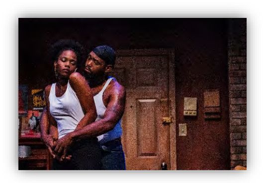
Dobama Theatre has been a GOS recipient since 2011.