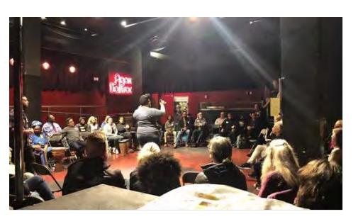
More than 100 people attended the February 2019 Arts & Culture Network Night at the Agora Ballroom

In addition to CAC and Neighborhood Connections staff, nine artists or arts & cultural professionals helped by assisting with planning and leading the event. CAC's aim for these sessions is to continue bringing the arts community together for relationship building, mutual support and to spark new initiatives with others. We are glad that these gatherings continue to have strong attendance a growing sense of ownership from the arts and cultural community. The next Arts & Culture Network Night