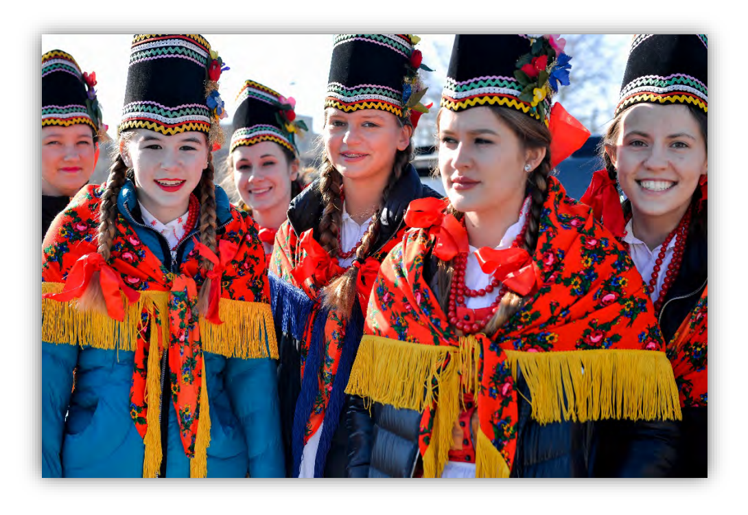
Slovenian Museum and Archives has received PS II funding since 2018.

<u>No</u> : No, evidence is not provided throughout the application that the funding criteria are met. Responses are unclear and/or do not address this funding criterion. The support materials may not be relevant and may not provide additional understanding of how the criteria are met.