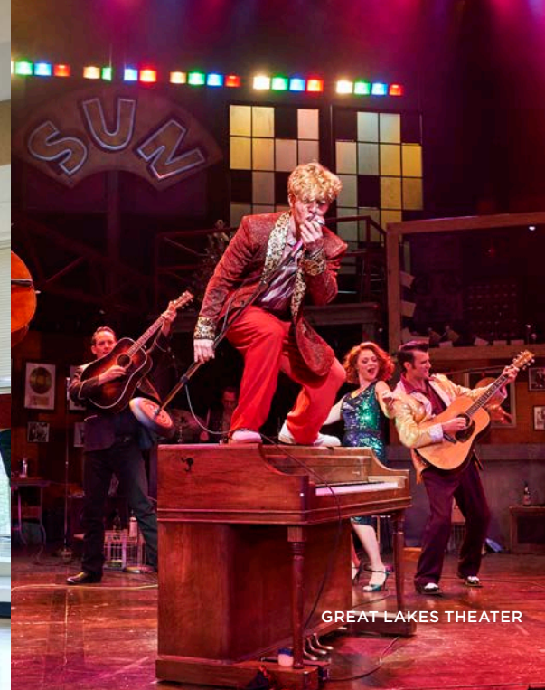
GREAT LAKES THEATER