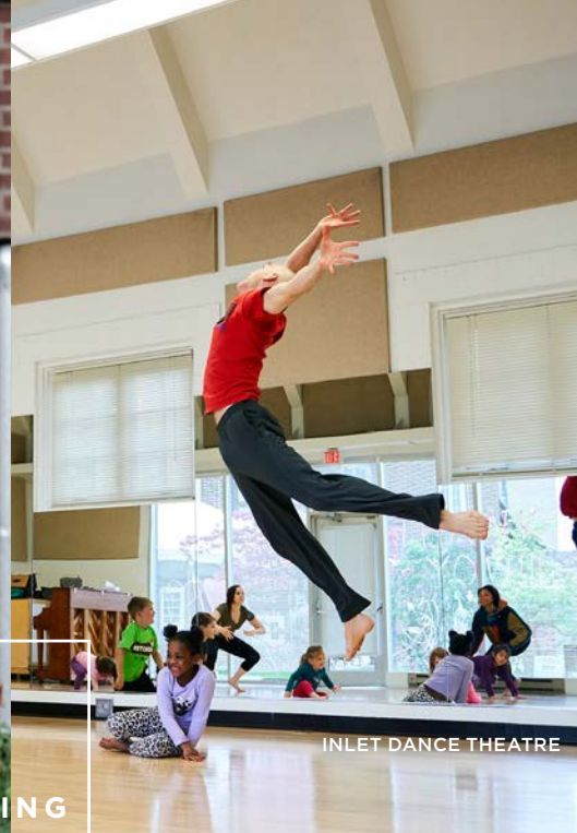
INLET DANCE THEATRE