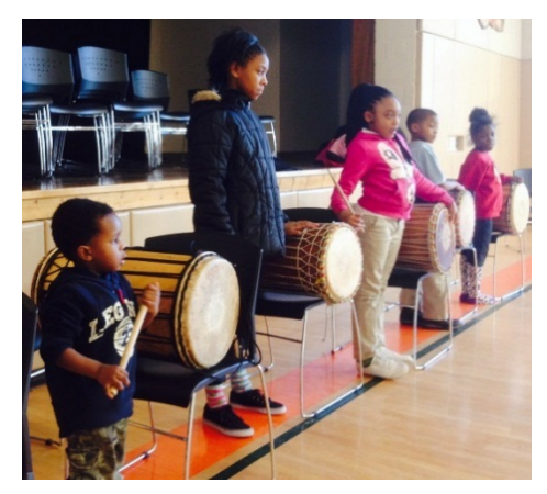
Photo: Students participate in a weeknight African drumming lesson through the Neighborhood Connections and CAC-funded West African Drumming Ensemble at Woodland Hill CMHA Community Center.

Through this partnership, we are gaining insight on how best to create and manage small grant programs and serve applicants. This knowledge transcends our Neighborhood Connections partnership; it is helping inform our own Project Support II program. In addition, this partnership is allowing us to connect directly with more County residents, increasing awareness of our agency and the importance of public funding for arts and culture.