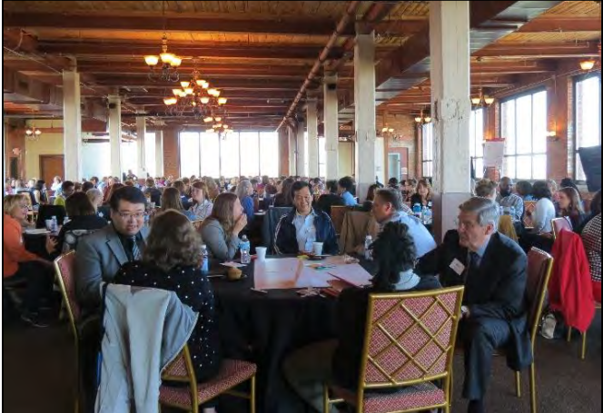
Left: A visualization of key takeaways from the kickoff presentation. Right: 150 cultural partners and community stakeholders gathered for roundtable discussion.