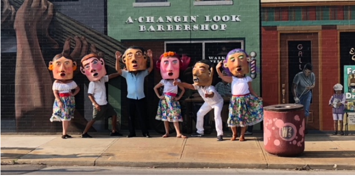
NC + CAC in Action: LatinUs Theater's cabezones (big heads) were a prominent part of the Puerto Rican parade (August 6) and La Placita (August 18). Cabezones are popular at festivals in the Caribbean, Central America and throughout Latin America. LatinUs Theater's Big Cabezas Project is co-funded by CAC through a grant from Neighborhood Connections.

Arts & Culture Network Night. On June 6, CAC and Neighborhood Connections co-hosted Arts & Culture Network Night at IngenuityLabs at the Hamilton Collaborative, the home of Ingenuity Festival. Over 50 people attended – representing a mix of artists, staff from arts organizations, other creative people and engaged residents.