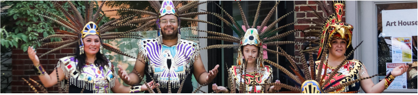
Art House - Big Read Kick off