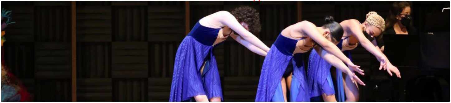
Cleveland School of the Arts Board of Trustees - Dance