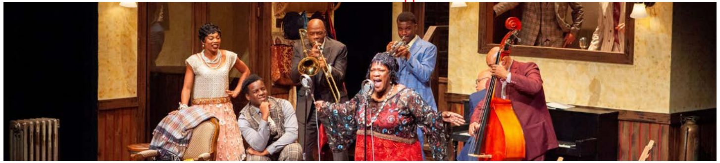
Karamu House

DRAFT - Not Board Approved General Operating Support Grant Guidelines • 7