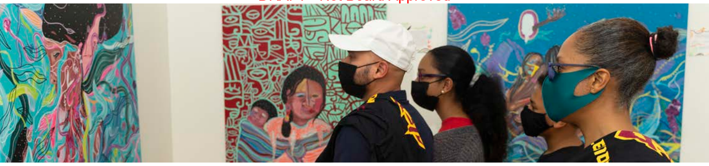
Julia de Burgos Cultural Art Center