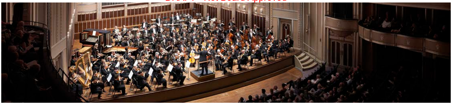
The Cleveland Orchestra