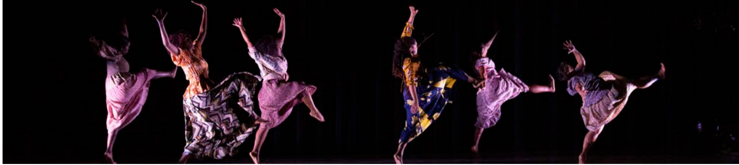
Mojuba Dance Collective