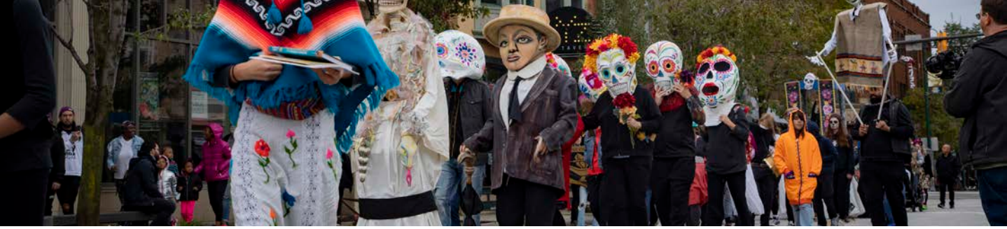
Cleveland Public Theatre - Dia de Muertos

PRAFT - Not Board Approved General Operating Support Grant Guidelines • 4