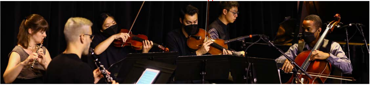
Cleveland Uncommon Sound Project