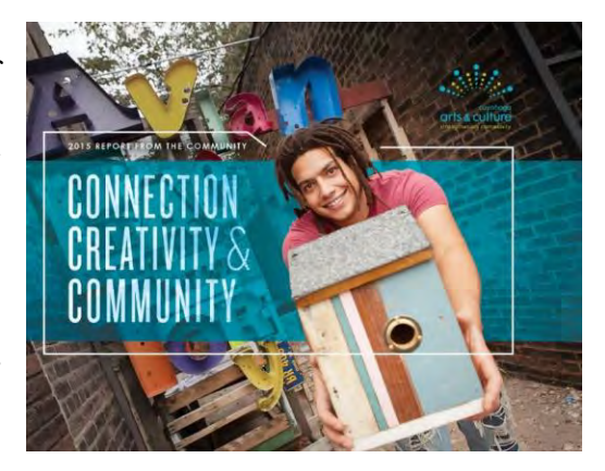
CAC's annual report went live August 1<sup>st</sup>. Look for a copy in the mail or visit <a href="http://report.cacgrants.org/">http://report.cacgrants.org/</a>

• Last month we rolled out our new Annual Report . New this year: the project features stories of individuals whose lives have been impacted by CAC. Our Report from the Community offers a chance for us to demonstrate the power that arts and culture has on people's lives, from a young boy visiting the Western Reserve Historical Society for the first time to a Cleveland Heights business owner who finds success connecting to the arts. Also new this year: Make sure to visit our new microsite — a vibrant, one-stop shop to see the annual report come to life. Visit: report.cacgrants.org, which has been viewed over 3,000 times since the launch of the report.