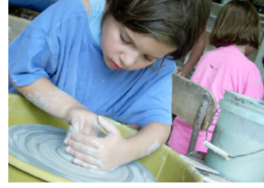
Photos (from left): An artist from Roots of American Music teaches a class at Wade Park School as part of the organization's "Literacy Through Song Writing" program in the Cleveland Metropolitan School District; Young Audiences ; Cleveland Public Theatre's Brick City Education Program ; Classes offered at the Orange Art Center.

IN 2010. CAC-FUNDED ARTS AND CULTURE ORGANIZATIONS SERVED: