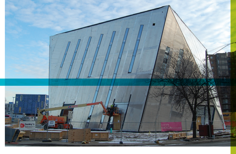
Photos (clockwise from top left): Cleveland Play House's production of Galileo in 2011; Construction of The Museum of Contemporary Art Cleveland (MOCA)'s new building in the Uptown district; Classes offered at the Cleveland Institute of Art.