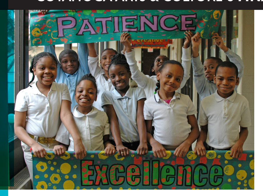
Photo: Students at the Cleveland School of the Arts Lower Campus participate in Young Audiences' visual arts program Parents as Arts Partners, part of the organization's Art Is Education program.