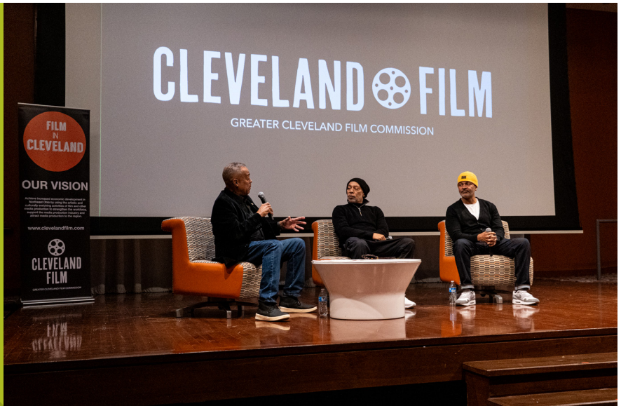
Greater Cleveland Film Commission