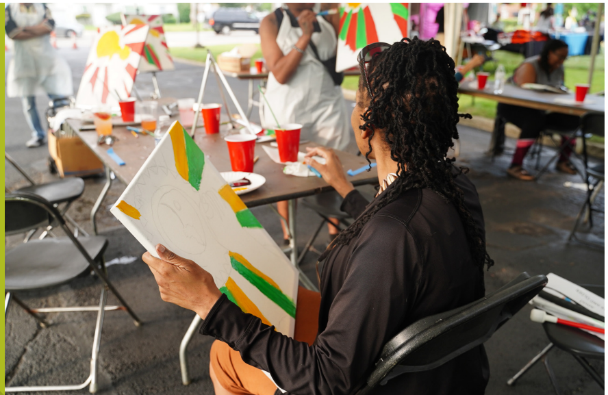
Harvard Community Services Center

The application must be submitted by 4:30PM ET on Thursday, June 25, 2026. The online system will not accept late or incomplete submissions.