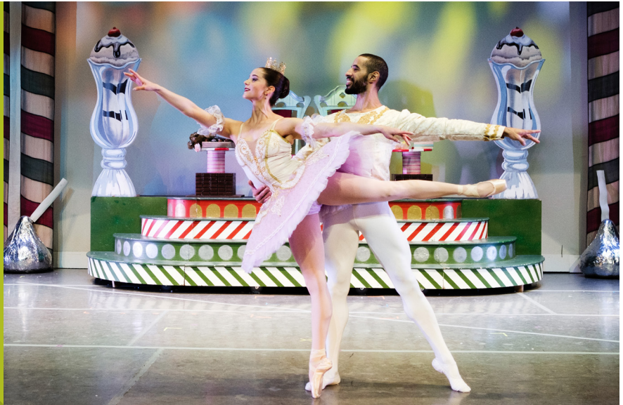
North Pointe Ballet

Successful grant applications will demonstrate Cuyahoga Arts & Culture’s three funding criteria: