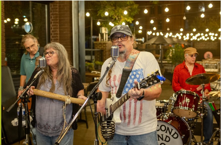
Cedar Fairmount Special Improvement District

The purpose of the Project Support grant program is to promote public access and encourage the breadth of arts and cultural programming in our community by supporting projects with a core arts and culture purpose in Cuyahoga County.