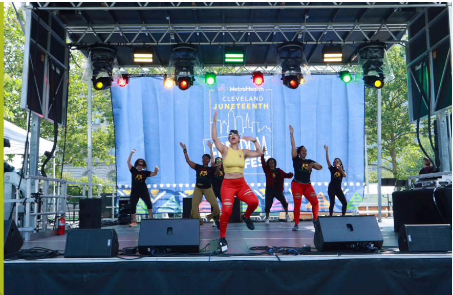
Downtown Cleveland Inc.