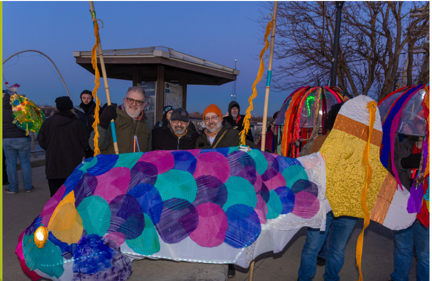
Canalway Partners

Greetings! Thank you for your interest in the 2027 Project Support grant program.