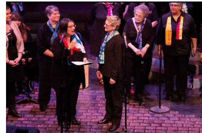
Pictured from left to right: The Refugee Response, Hispanic Police Officers Association and Windsong, Cleveland's Feminist Chorus (all three will receive CAC funding for the first time in 2020)

Continued Grantmaking Partnership with Neighborhood Connections. In 2013, CAC formed a partnership with Neighborhood Connections, a grassroots grantmaking program affiliated with the Cleveland Foundation. Since then, CAC has funded over 340 resident-led arts and culture projects in Cleveland and East Cleveland. In 2019, our $75,000 investment helped co-fund 24 neighborhood projects. Through our investment in Neighborhood Connections, CAC co-funded grants of up to $5,000 twice a year in May and November to groups of residents in Cleveland and East Cleveland who organize projects to improve the quality of life in their neighborhoods. Groups are encouraged to work with their neighbors to propose creative solutions to challenges in their community.