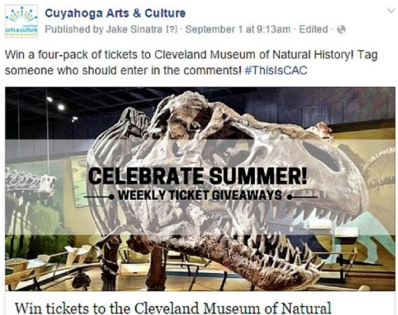
Win tickets to the Cleveland Museum of Natural History! To celebrate summer, Cuvahoga Arts & Culture is giving away free tickets to arts

Our next campaign will go beyond our cultural partners to create a direct connection with residents. By targeting and communicating stories and graphics featuring specific resident segments, we aim to boost engagement on our digital platforms during the month of October.