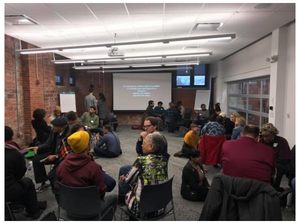
gather for the first of three full-day workshops in CPCP's Learning Lab, funded by CAC.