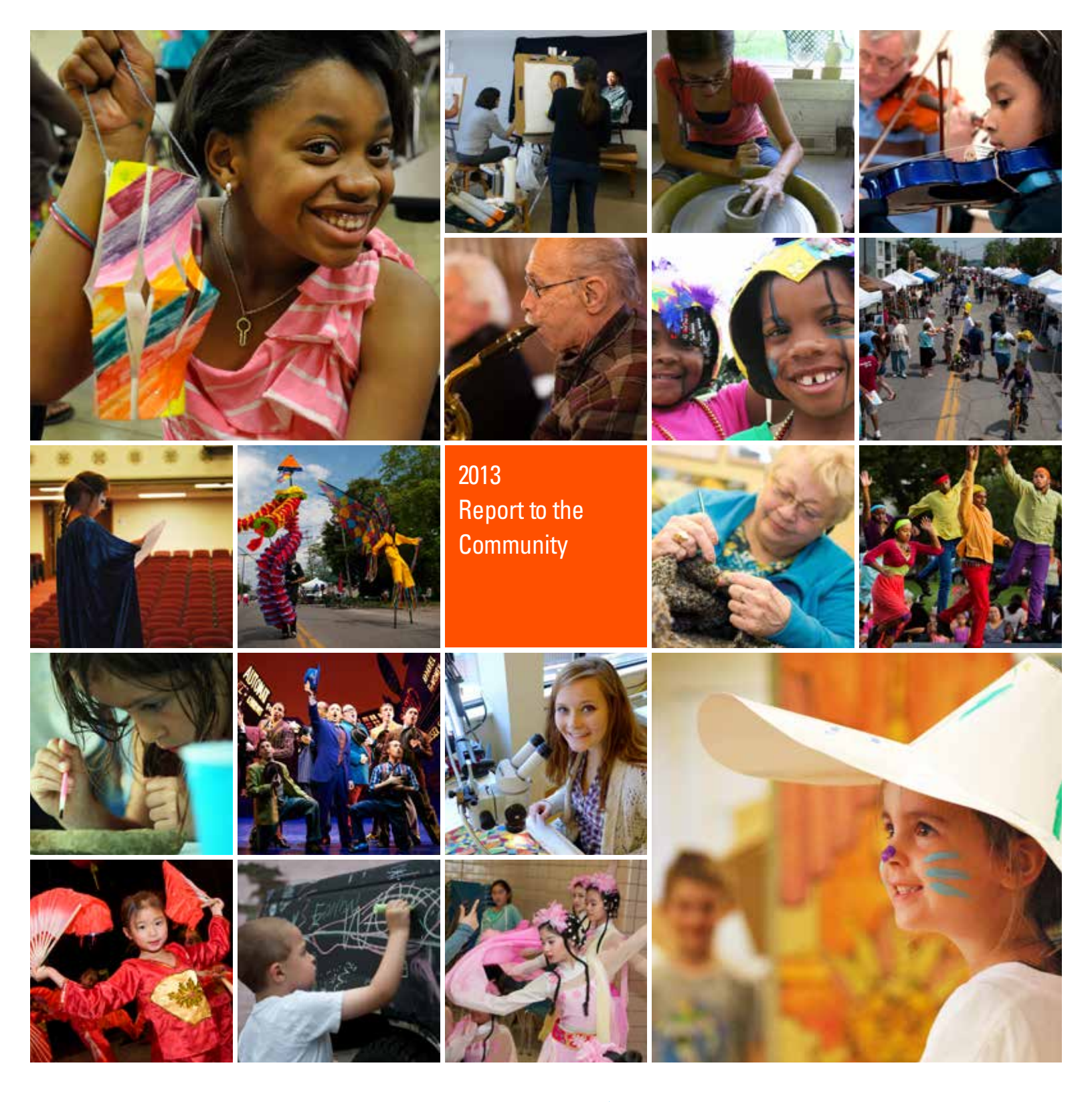
Your Investment. Strengthening Community.