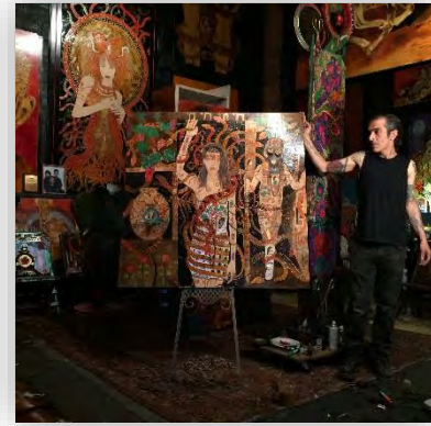
Negative Space Gallery has been a Project Support II recipient for the past three years.

The purpose of Cuyahoga Arts & Culture’s Project Support (PS) grant program is to promote public access and encourage the breadth of arts and cultural programming in our community by supporting Cuyahoga County-based projects. Grant applications are reviewed annually through a public panel review process. CAC will offer two Project Support grant options in 2018 for projects occurring in the January 1 – December 31, 2019 grant period. This document provides the guidelines and application instructions for the Project Support II program.