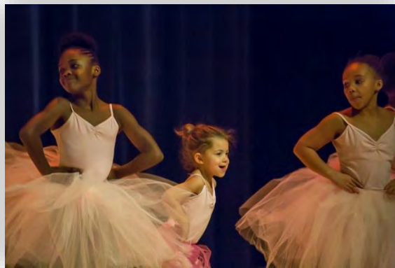
Cleveland Inner City Ballet (Pink Tutu Outreach Company) has received a PS II grant since 2015.