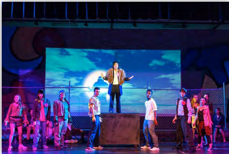
Heights Youth Theatre has received a Project Support I grant for the past three cycles.

A Cultural Partner not in good standing with CAC will be officially informed of this status in writing.