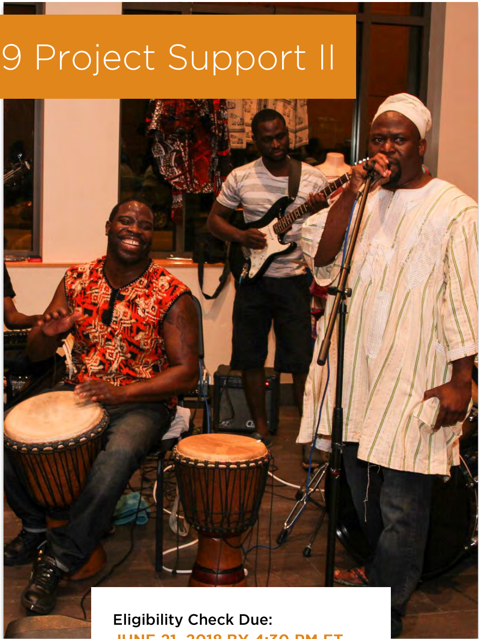
Diapo Cultural Arts Juneteenth Concert

Eligibility Check Due: JUNE 21, 2018 BY 4:30 PM ET