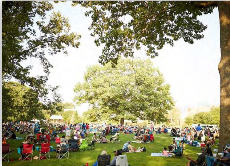
University Circle Inc.'s WOW: Wade Oval Wednesdays has received CAC funding since 2008.

These are general guidelines and are subject to change based on the total CAC funds available to the Project Support grant program in any given year. It is possible that all of the allocated Project Support grant funds could be awarded to those applicants receiving higher scores and applicants with lower scores (within the 75-100 point range) will not receive funding.