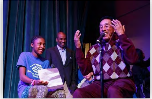
The Boys & Girls Clubs of Cleveland has been a Project Support I recipient since 2013.

The purpose of Cuyahoga Arts & Culture’s Project Support (PS) grant program is to promote public access and encourage the breadth of arts and cultural programming in our community by supporting Cuyahoga County-based projects. Grant applications are reviewed annually through a public panel review process. CAC will offer two Project Support grant options in 2018 for projects occurring in the January 1 – December 31, 2019 grant period. This document provides the guidelines and application instructions for the Project Support I program.