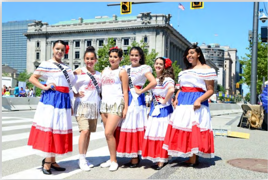
Julia de Burgos Cultural Arts Center has received CAC funding since 2015.

to partner with us effectively. Cultural Partners that do not comply with these expectations may be subject to a reduced final grant amount.