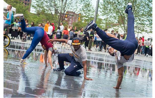
Public Square comes alive with programming.