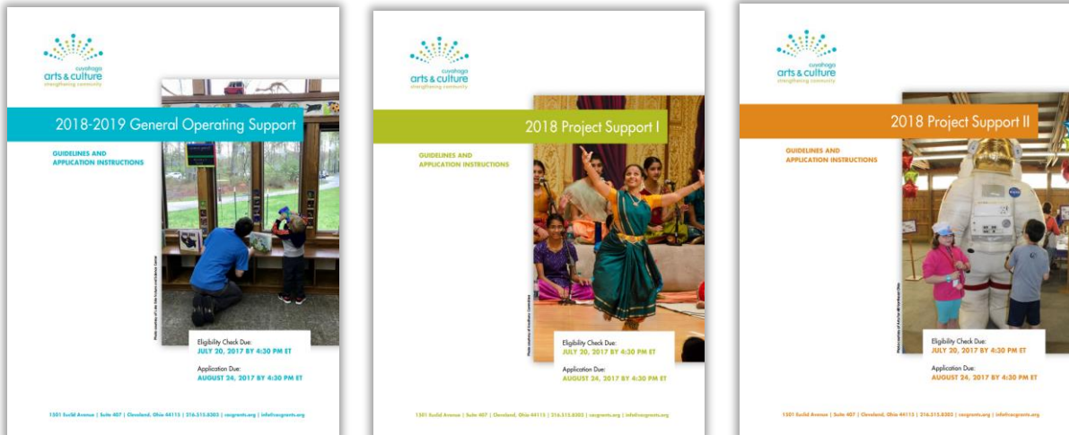
CAC's 2018 Grant Guidelines, pictured above, opened to applicants in mid-May.

This includes a simplified application process across all programs, most notably in the GOS program. Current GOS cultural partners with five years of consistent CAC funding will not be required to submit an eligibility check or application this cycle . Those current GOS cultural partners that wish to "opt-in" to the application process will need to notify CAC by June 30 and will receive more details on the 2018-19 requirements later this month. See FAQs about this change .