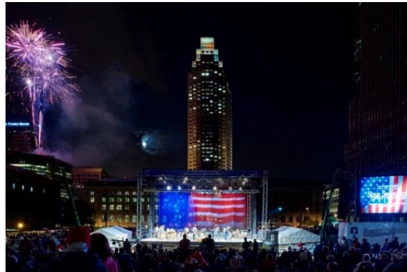
CAC's funded Star-Spangled Spectacular returns to Mall B for this year's June 30 th concert.

Save the Date – Star-Spangled Spectacular is June 30: The Cleveland Orchestra recently announced the 28th annual, free community concert in downtown Cleveland, which will take place on Friday, June 30 at 9:00 p.m. This year, the concert will be held on Mall B, located at 300 St. Clair Avenue, Cleveland, between the Global Center for Health Innovation and Cleveland Public Auditorium. This community celebration has been supported by Cuyahoga Arts & Culture since 2007, and staff is working in partnership with the orchestra staff to raise awareness of this year's concert and to highlight CAC's public support appropriately through event promotions and marketing.