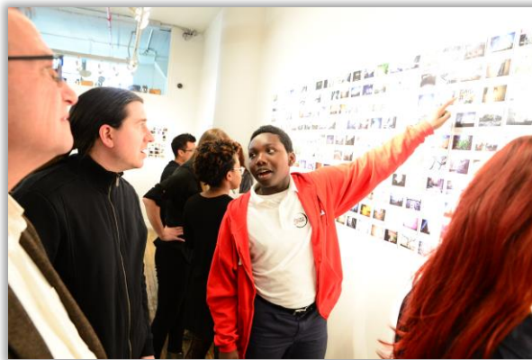
Project Support in Action: Cleveland Print Room's opening event.