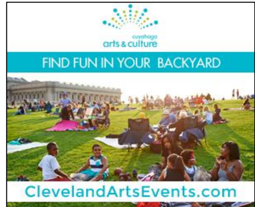
A sample of CAC's ads -which will reach thousands of residents through our pilot digital marketing campaign this summer.

In addition, CAC will test a new communications strategy by leveraging digital marketing through a partnership with Raycom Media, managed by CBS/Channel 19 Cleveland. Through a modest investment, staff will develop ads that will be delivered to mobile and desktop web users who fit a marketing profile and express an interest in arts and entertainment. CAC ads will be shown more than 120,000 times per month. With an industry average click-through rate of 1%, this will drive new visitors to CAC's events website to learn more about CAC and connect with CAC-funded events in their community.